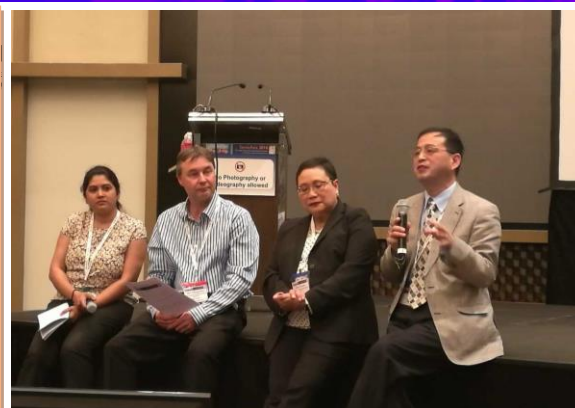
FOP WORKSHOP Q&A SESSION